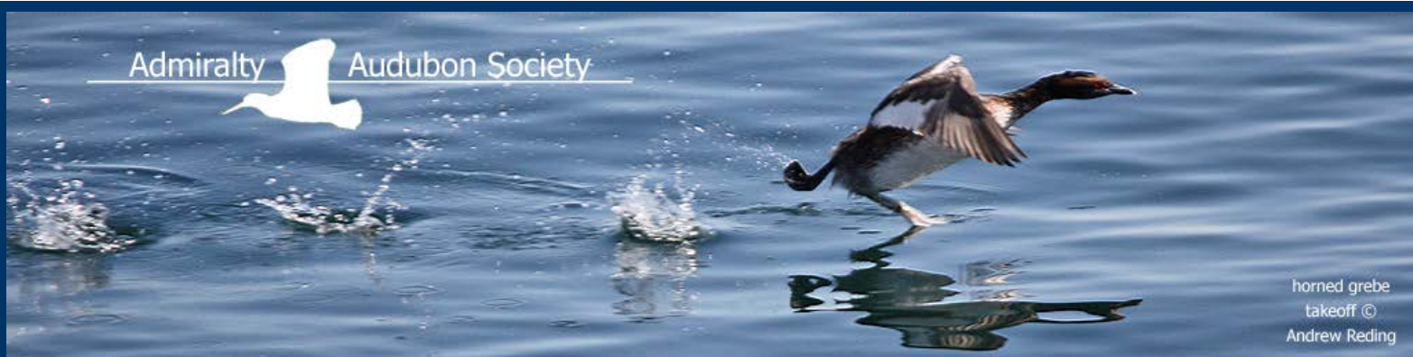
horned grebe takeoff