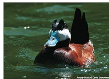
Ruddy Duck